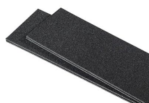
1510TPDIV Extra TrekPak Dividers