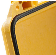
1623 Replacement O-ring