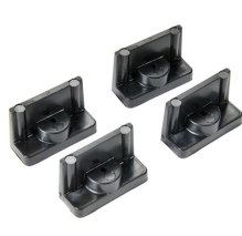
1507 Quick Mounts - set of 4